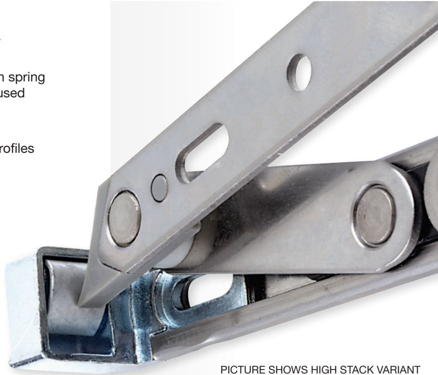
PICTURE SHOWS HIGH STACK VARIANT

Accessories: Hinge Jigs (page 34), Anti-Jemmy & Child Restrictor (see page 37)